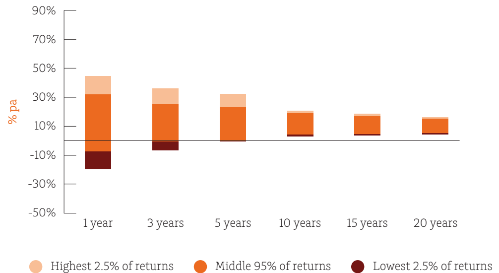
Ranges of returns for the Trust's benchmark asset allocation based on investment market returns from 1900 to 2019 (before fees)

The graph below shows how broad the ranges of investment market returns have been over more than 100 years. It illustrates that historically the longer the investment time period the narrower the range of returns.