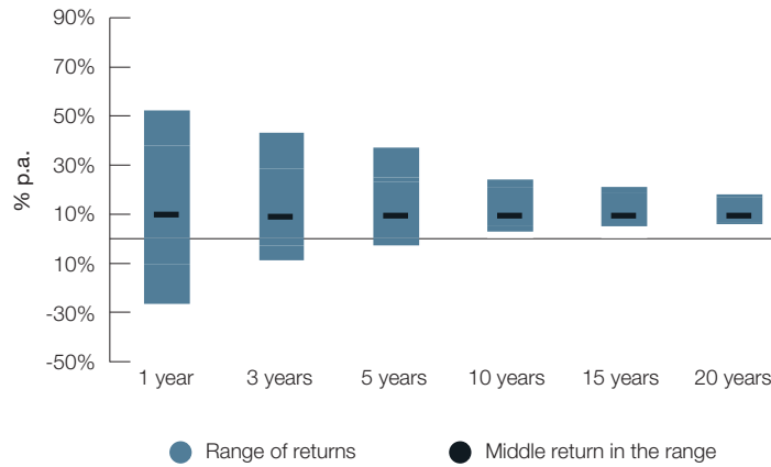
Ranges of returns for the Trust's strategic asset allocation based on investment market returns from 1900 to 2020 (before fees)